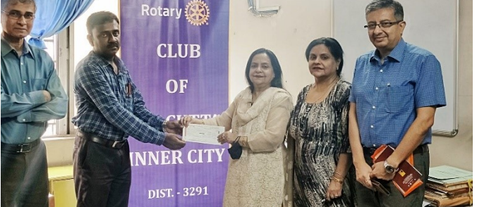
Visit to CINI on 24<sup>th</sup> October.